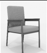
SL171BC Bariatric Guest Chair COM - 3.25 yds / COL - 36 sqft W-36 D-36 H-36 SH-19 AH-26 40lbs